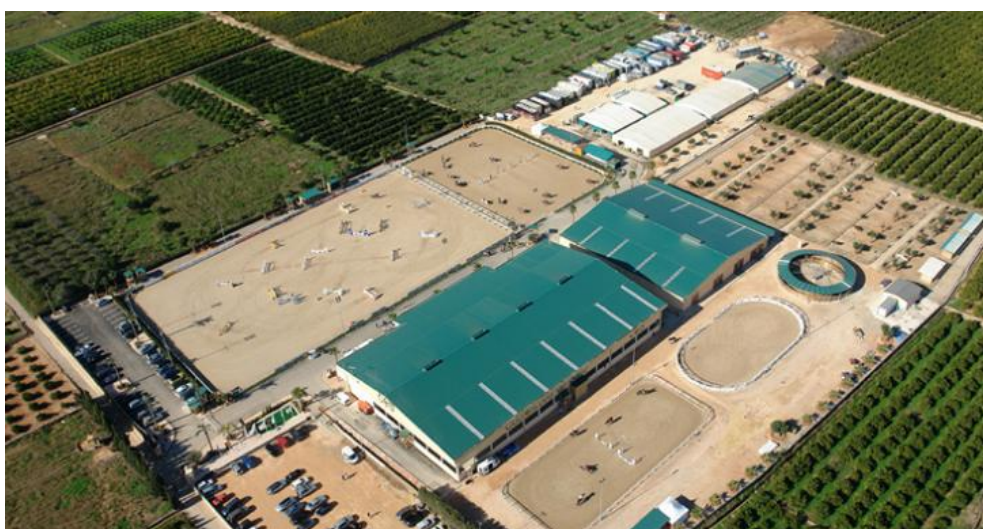
CENTRAL MEETING POINT FACILITIES